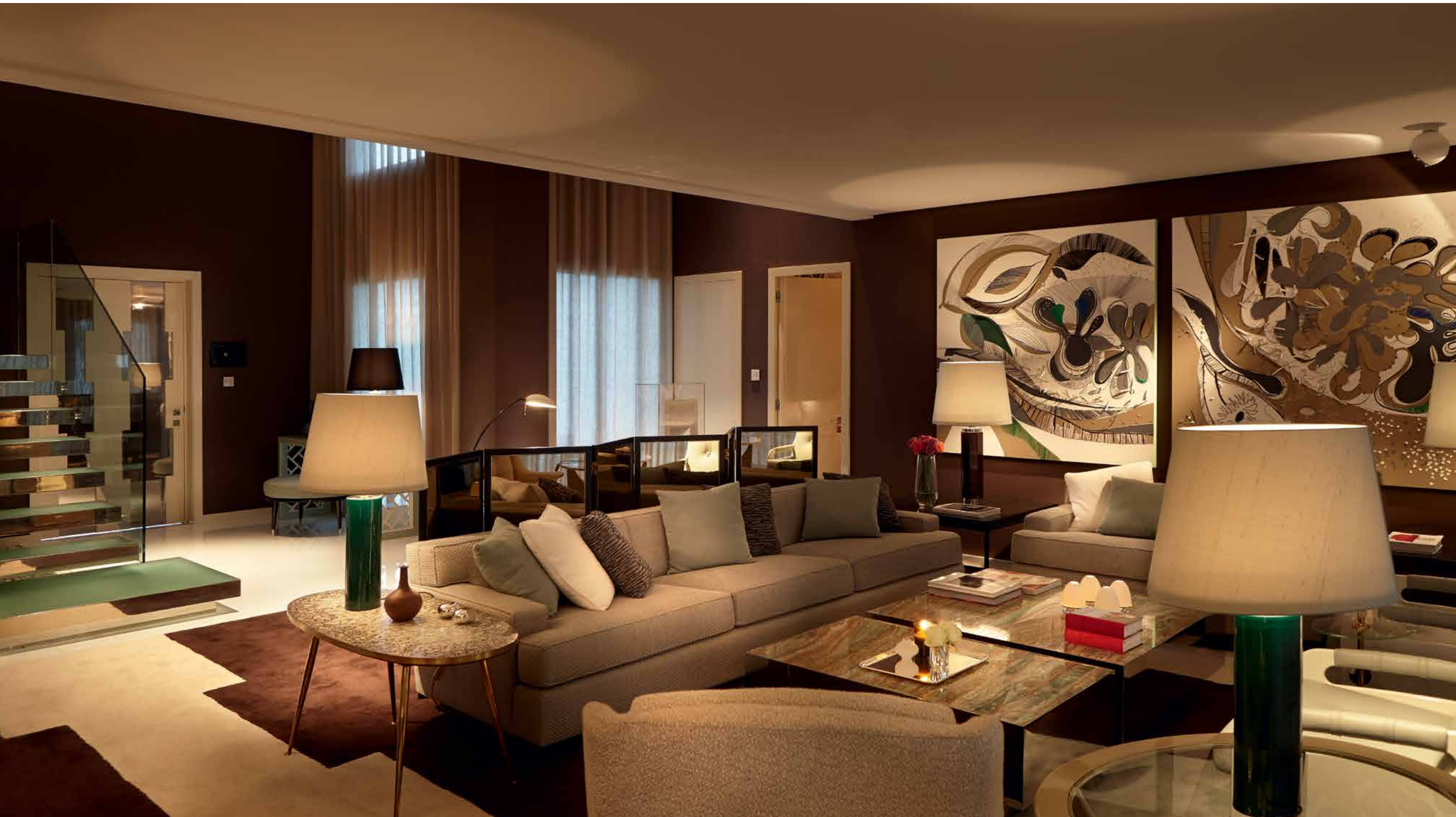
Living room view with Biarritz sofas and polished steel emerald onyx top coffee tables (both designed by Ding Dong). On the left wall "Deep Ocean" diptych by Jorge Ramos