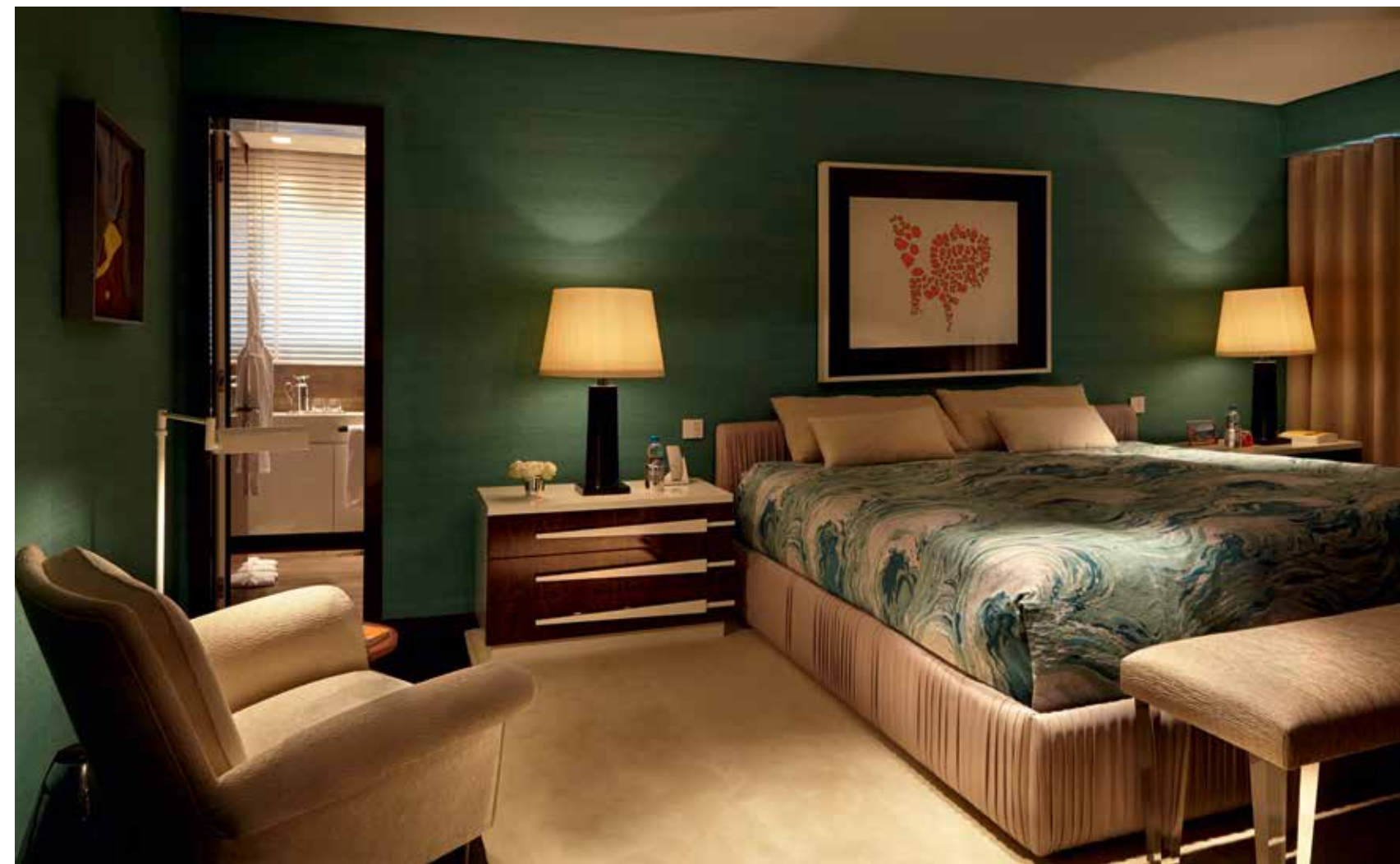
Master bedroom using graphic elements such as the table lamps, bedside tables and a Ricardo Pistola drawing, to balance textures: quilt complex fabric, delicate silk wallpaper, draped leather bed base