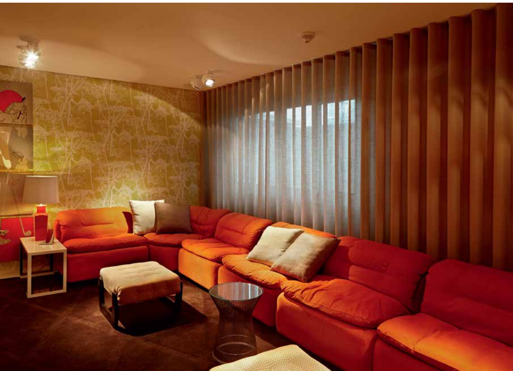
TV room with vintage Knoll sofas renewed with Jim Thompson fabric e footstools with Hermès upholstery